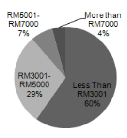
Fig. 3. Students saving and household income

About half of the respondents agreed that they keep their money in the account for future use in case if they have specific need or interest. This specific act describes that they realized the importance of building financial future security. These findings represent an initial indication in tackling personal finance issues in young people's futures particularly when they start to utilize credit cards, make larger purchases like homes and real estates, while still managing their finances responsibly.