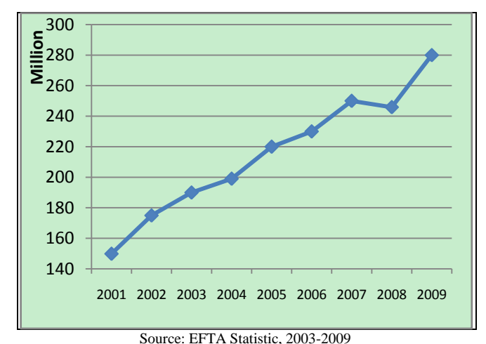
Fig. 1. Total fair trade retail value (in euros) by all EFTA members jointly.

Fair Trade has been successfully realized. The results, showed that the system justice in the world trade can be created and certainly not just a dream anymore.